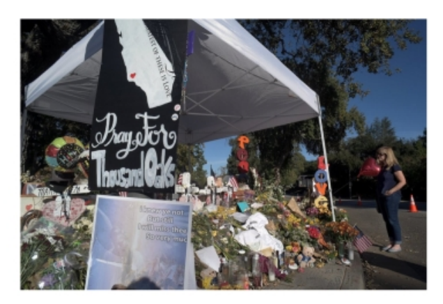
The Acorn Newspaper captures a woman taking a moment to remember the victims of the Borderline Tragedy.

There is power in giving voice to our own experiences, and power in sitting across from others as they share their experiences. When stories are shared we see one another with new depth, appreciation, and compassion. Perhaps you are connected to a particular group that could benefit from this listening experience. Groups may include: office staff, professional groups, friends and family members, church or community groups, neighborhoods, school communities, or more.